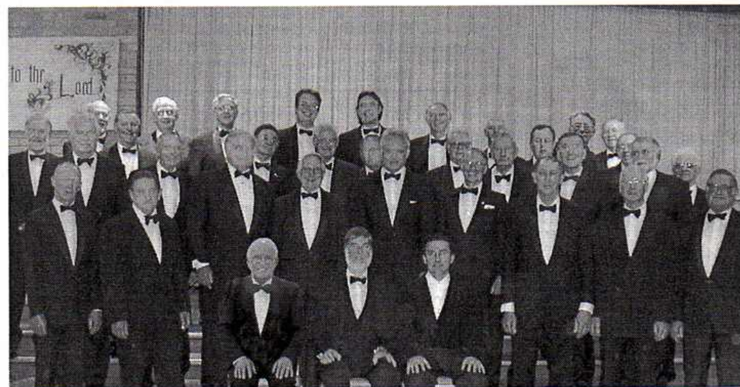
A photo taken at the Lutheran Homes, Glynde, concert at which nearly all the members were present.

We all hope that we can bring some enjoyment to you next year.